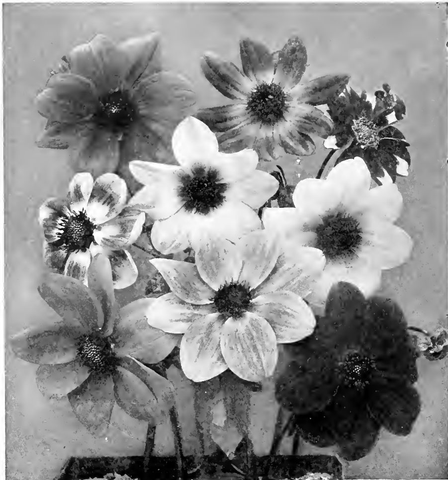
Types of New Century Dahlias showing their decorative possibilities

PANSY. Size 4½". Ht. 4 ft. Richest glowing maroon, shaded black and tinting bright glowing crimson at tips of petals. Base of petals bright yellow, producing the bright yellow zone around the yellow disc. Very striking and effective. . . . . $1.00